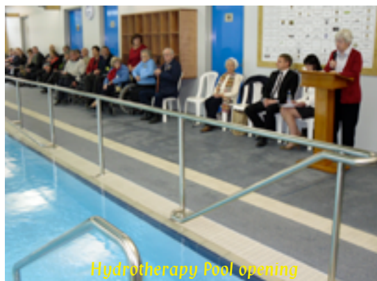
Hydrotherapy Pool opening