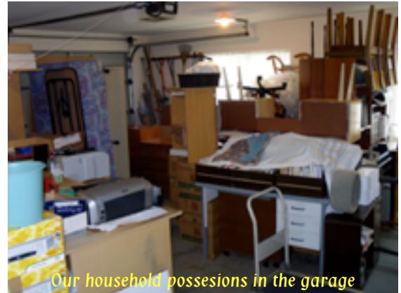
Our household possessions in the garage