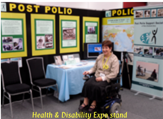
Health & Disability Expo stand