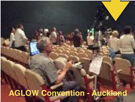
AGLOW Convention - Auckland

In March Noel and Edith attended the AGLOW Convention in Auckland, recording and selling videos.