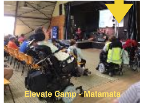
Elevate Camp - Matamata