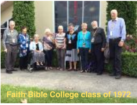
Faith Bible College class of 1972